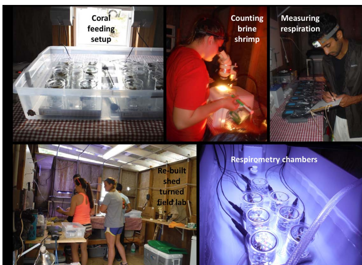
Field laboratory at the Hawaii Institute of Marine Biology showing various activities as described.