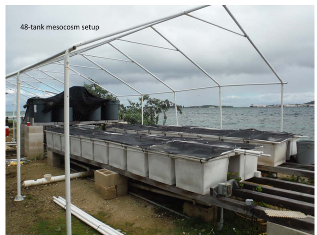
Experimental setup with 40 tanks. Ten tanks will be held at each of the following conditions: 1) ambient temperature and acidity, 2) ambient temperature with elevated acidity, 3) elevated temperature with ambient acidity, and 4) elevated temperature and acidity.