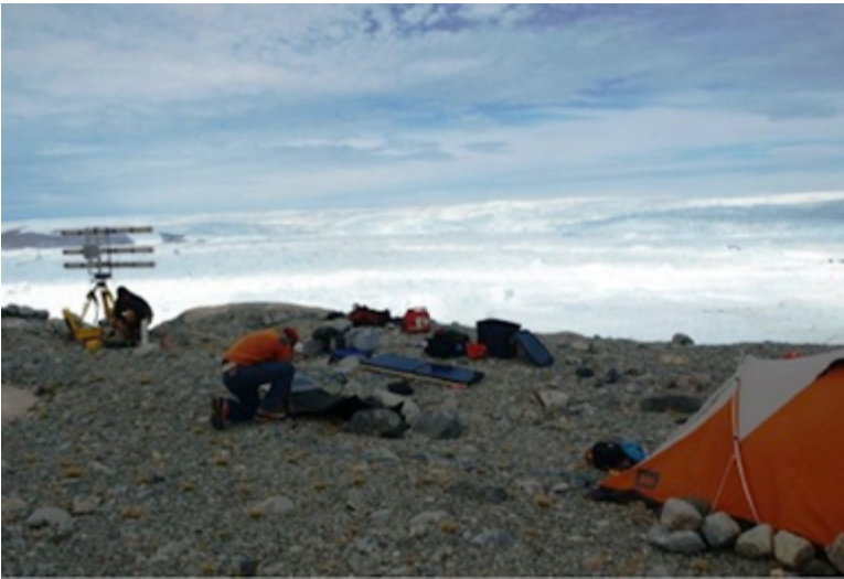
The field team at camp with the radar array to the left and the Jakobshavn Glacier, west Greenland, in the background. This glacier is suspected of producing the iceberg that sank the Titanic.