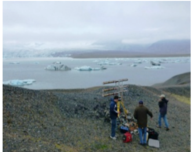
Setting up the radar at Breidamerkurjökull, Iceland. The front of the glacier is in the upper left. New, robotic oceanographic sensors were tested in the iceberg-filled lagoon in the front of the glacier.