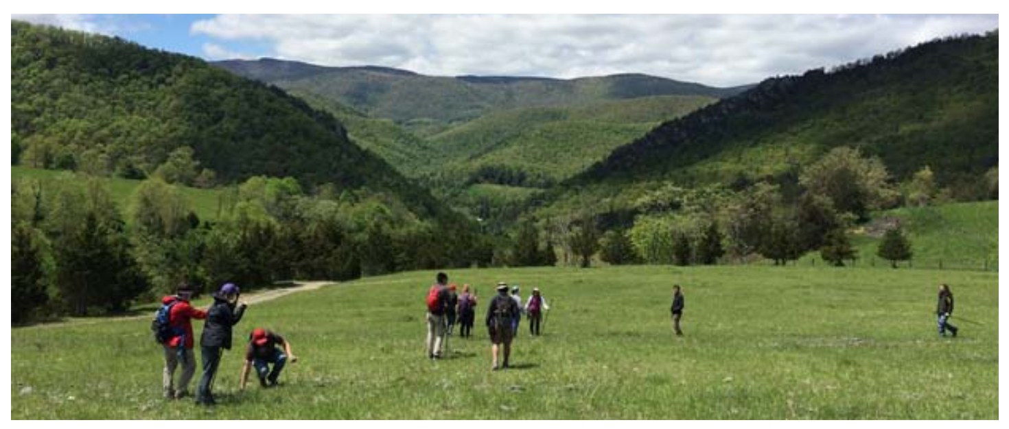
Dolly Ridge section beginning in eroded core of anticline at Germany Valley, WV. Outcropping of Ordovician limestone ledges is initially limited in cowpasture, providing an exercise in use of a jacob staff, but becomes 100% exposed as road on left reaches tree line.

Prof. Matt Saltzman led an Appalachian Basin field trip to eastern West Virginia (Seneca Rocks region) May 2-5, 2017 with the ES 5618/8800 course. The group was based in Germany Valley (no cell phones and no internet!) beneath North Fork Mountain. Sections were studied in detail at 6 localities, including the Ordovician Black River and Trenton succession at Dolly Ridge and Arc Hollow, WV; the Ordovician-Silurian Juniata-Tuscarora at North Fork Mountain, WV; the Silurian Rose Hill to Wills Creek at Blue Grass, VA; the Siluro-Devonian Tonoloway-Helderberg successsion at Mustoe and McDowell, VA; and the Late Devonian Foreknobs (Catskill) formation at Briery Gap, WV. Another set of smaller outcrops were visited in the Late Ordovician Reedsville and Lower to Middle Devonian Oriskany-Needmore-Marcellus (Millboro) formations. Despite a late dinner bell the first night, things went mostly as planned andthe rain held off until 5:30 pm on the last outcrop of the last day! The field group included undergraduates Taylor Hollis, Brandi Lenz, Sean Newby, Bryan O'Reilly, Nick Rodgers, and Shelby Brewster (field assistant), and graduate students Datu Adiatma, Aaron Evelsizor, Myles Moore, Caroline Robinson and Casey Saup.