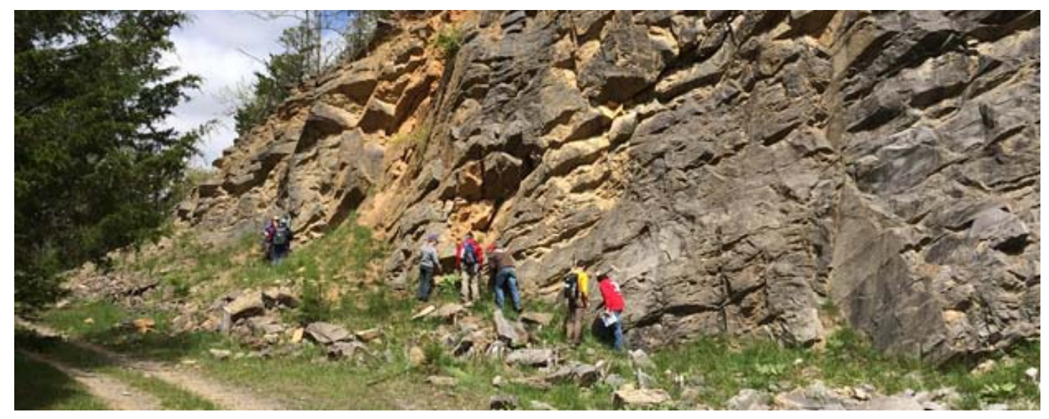
Complete exposure of Ordovician Black River Group at Arc Hollow.