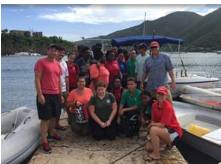
Gifft Hill School students and teachers with Basin Research Group