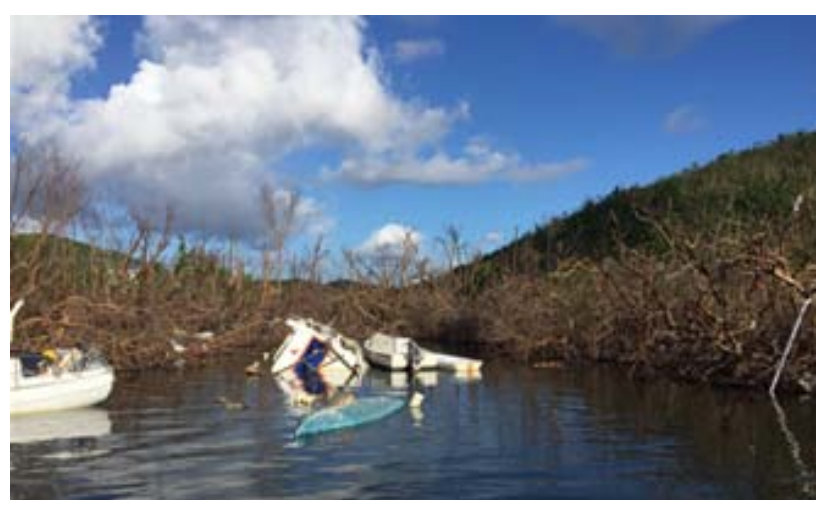
Common scene with vegetation stripped from the mangroves/trees and boats overturned and sunk in the harbor

The community of Coral Harbor and the eastern half of the island were still without electricity and involved in the large clean-up effort of debris, which included many downed trees, power lines, structures, and boats that were either sunk or washed ashore. During the final day of the trip the team hosted a group of 15 local high school students to provide hands-on demonstrations of multibeam mapping, water sampling, and sediment coring.